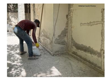
PRESBYTERIAN DISASTER ASSISTANCE

We follow Jesus' example; walking alongside the most vulnerable WE ARE THE CHURCH, TOGETHER; and we are there with those who need us.