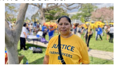
SELF-DEVELOPMENT OF PEOPLE