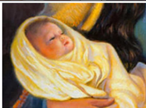
Contemporary - USA