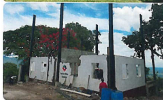
Before and Current Photos of the Main Building (above) and Kitchen/Dining Hall (below)