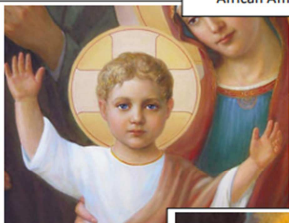
Lithuania ~ Ukraine Jesus