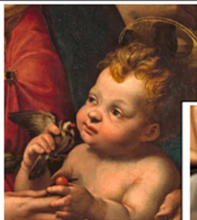
Italian Renaissance Jesus