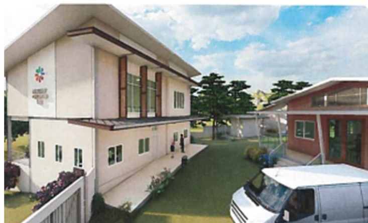
Rendering of the New Nutrition Center