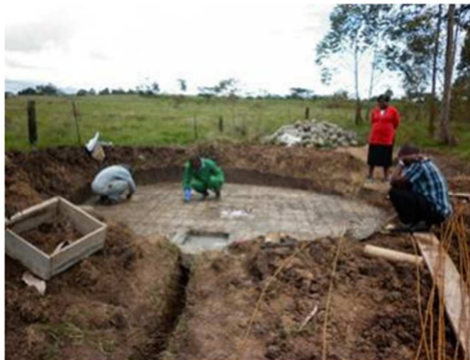
Beginning of Construction of Water Storage Tank at Kongasis