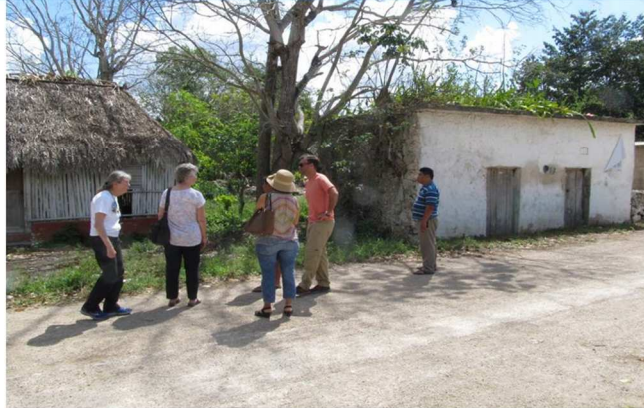
Two buildings to be razed before installation of new water building

Two buildings will be built. One for the water purification system and the other as bathrooms